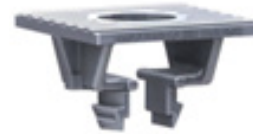
SnapStak Plus Adjustable Hangers: Table 2