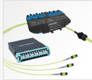
SYSTIMAX ULL portfolio