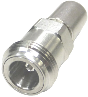
Type N Female for CNT-400 braided cable