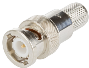
BNC Male for CNT-400 braided cable