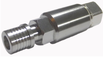
QMA Male connector for 1/4 in FSJ1-50A cable