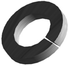
Galvanized Lock Washer, 3/8 in