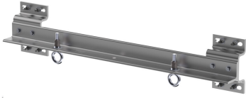
Cable Support Mount for Guyed Towers to Support Cable, 41 or 42" Face

The 860674607-041-42 is a purpose built tower face bracket that is designed to support 1000 pounds of cable per eye up to 2000 pounds in combination. Ideal for Hybrid cable. Includes mounting eye bolt for attachment.