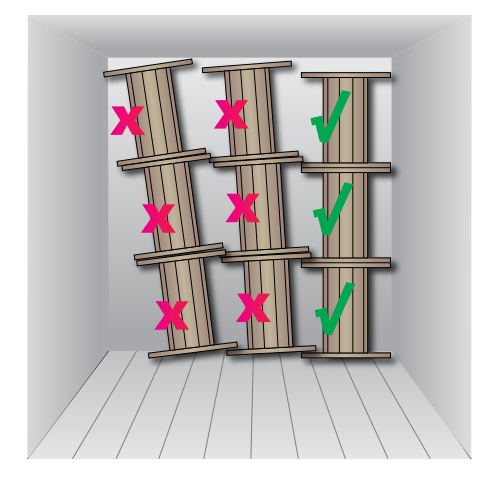
Proper loading diagram.

Pickup requests must meet the minimum reel quantity per truckload. Multiple reel size combinations must achieve at least a full truckload.