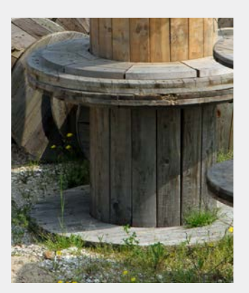
Discolored wood that is undamaged is acceptable.