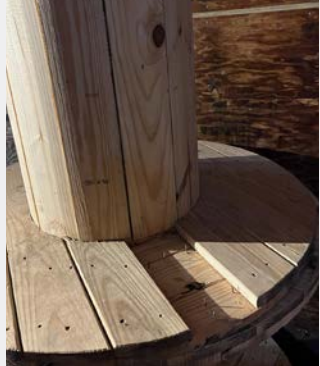
Do not return a cable reel with a damaged flange.