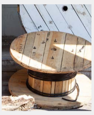
Do not return a reel with cable tails or cable left on the drum.