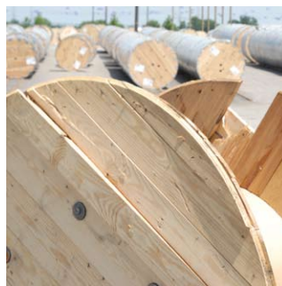
Damage to multiple components