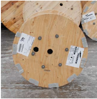
No damage— minor reconditioning required

For reels constructed using fiber hubs; Buy-Back payment will apply as long as any damage is limited to 1 of the 3 components.