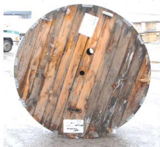
Flange is rotted