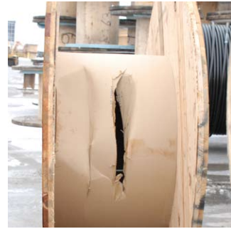
Damage limited to the drum

For reels constructed with wood staved and plywood hubs; Buy-Back payment will apply as long as damage is limited to the plywood wrap