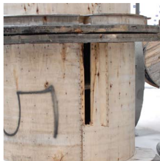
Flange OK, plywood wrap damaged

For reels constructed with wood staved and plywood hubs; Buy-Back payment will apply as long as damage is limited to the plywood wrap