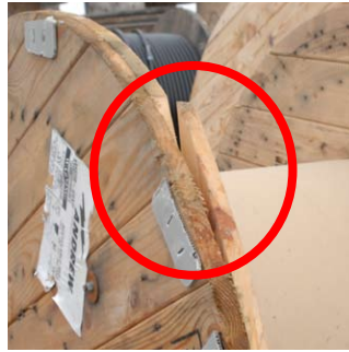
Damage limited to a single flange