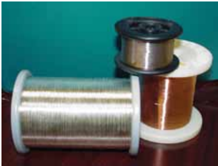
Copper Clad Aluminum Wire

Copper Clad Aluminum (CCA) is an electrical conductor that has an outer sleeve of copper metallurgically bonded to a solid aluminum core. In this particular case, the copper makes up 15% of the cross sectional area of the conductor. The combination of these two metals makes it uniquely suited to many electrical applications where weight to electrical conductivity issues are important.