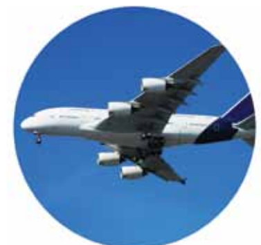
CCA used in Airbus A380