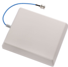
Cell-Max™ Directional In-building Antenna, 698–960 MHz, 1710–2700 MHz

This product was discontinued on: July 30, 2022