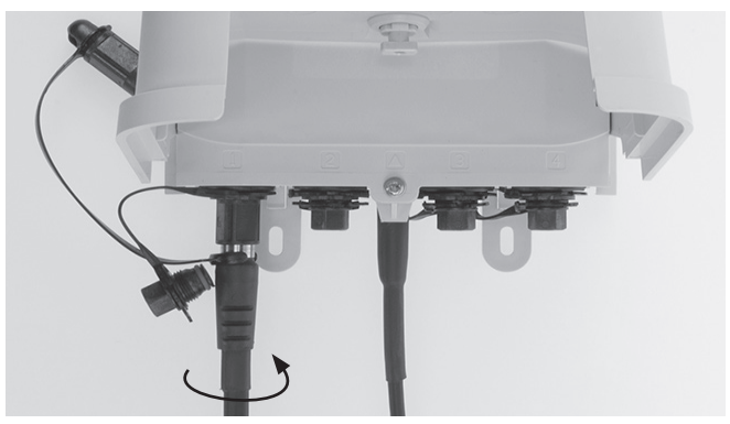
2.1 Unscrew the dust caps off both, the connector and the adapter, and install the hardened connector (hand tighten).

Always clean the connector before inserting!