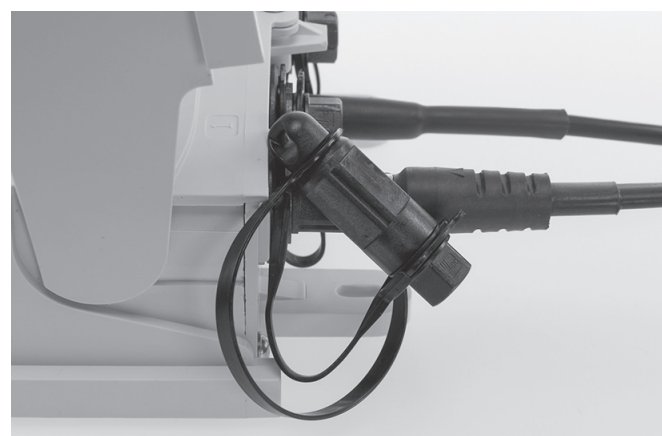
2.3 Connect the 2 dust caps from terminal port and hardened connector to keep the dust caps clean for future use.