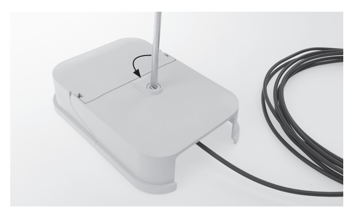
1.1 Open the terminal with a flat screw driver. Turn 90° counterclockwise.