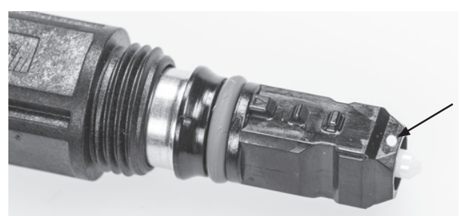
2.2 Orientation of the connector: white dot facing upwards.