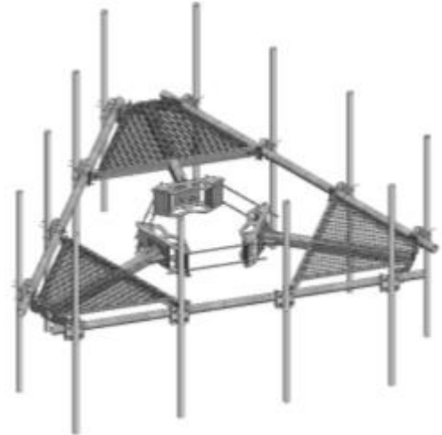
MC-PK-M Series Low Profile Platform

Please contact steelproducts@commscope.com for any additional information. Office: 817-864-4112.