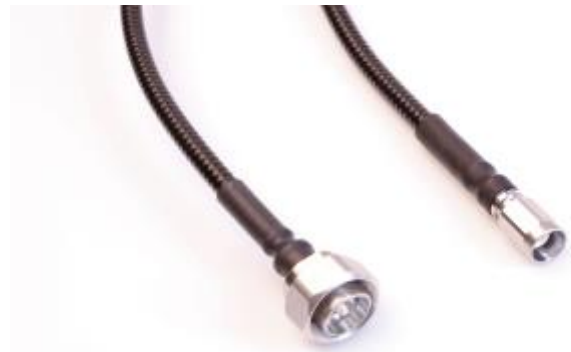
4.3-10 versus NEX10 Assemblies

Well-positioned for the future demands of the telecom industry, CommScope announces the release of new cable assemblies specially designed for small cell applications to allow more connections in tight spaces: NEX10™ SureFlex® cable assemblies. Even smaller than current industry standard 4.3-10 connectors, NEX10 cable assemblies offer low PIM and low return loss with a compact and robust design ruggedized for outdoor applications. These new connectors are offered on Heliax® ¼” SureFlex cables and are available in CommScope D-Class grade which guarantees PIM performance with 100% dynamic testing.