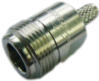
Type N Female for CNT-240 braided cable