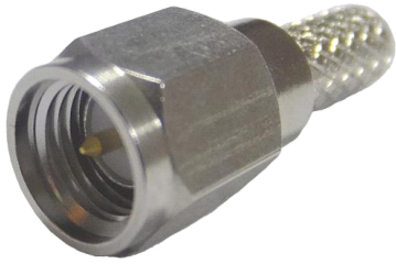
SMA Male for CNT-195 braided cable