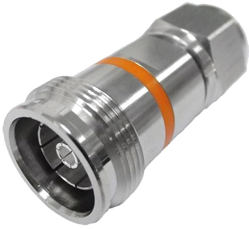
N Male to 4.3-10 Female Low-PIM Adapter