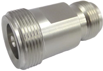
Type N Female to 4.1-9.5 DIN Female Adapter