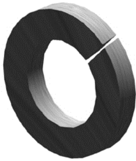
Galvanized Lock Washer, 5/8 in