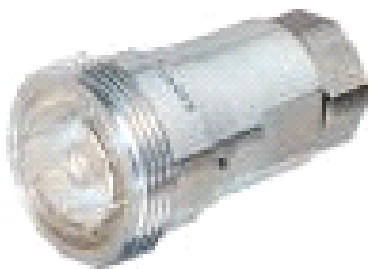
7-16 DIN Female for 1/2 in FSJ4-50B cable