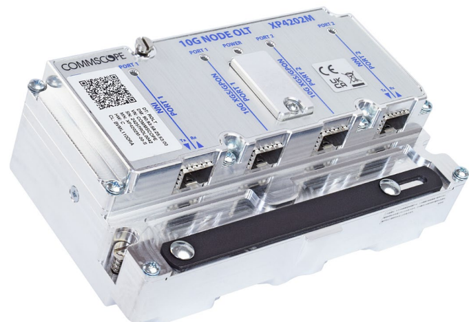
CommScope PON Evo 200 Series R-OLT

The 200 Series OLT utilizes standard 10G Ethernet uplinks, including CWDM, DWDM, and Bi-Di, for connecting to a Leaf Aggregation switch/router in the Converged Interconnect Network (CIN). This capability enables cable operators to utilize their transport backhaul fiber resources efficiently while extending the deployment of FTTX to serve customers at distances well beyond the typical 20 km reach of centralized, chassis-based PON architectures.