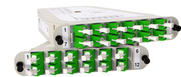
FPX Fiber Optic MPO Module, Singlemode OS2, 12 fiber SC/APC adapter, left, putty white