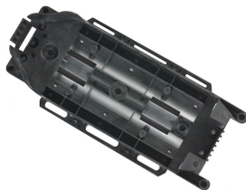
MST, Fiber Optic Universal Mounting Bracket, 2/4 port