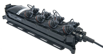
MST, Fiber Optic Multiport Service Terminal, 8-port, long 2xN port, locatable flat loose tube cable, 100 m