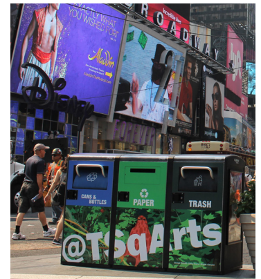
Public messaging platform “where the people are”

Copyright © 2018 Ruckus Networks, an ARRIS company. All rights reserved. No part of this content may be reproduced in any form or by any means or used to make any derivative work (such as translation, transformation, or adaptation) without written permission from Ruckus Networks (“Ruckus”). Ruckus reserves the right to revise or change this content from time to time without obligation on the part of Ruckus to provide notification of such revision or change.