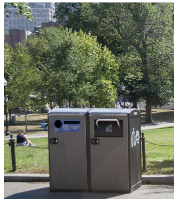
Cleaner, less congested parks—the urban oasis