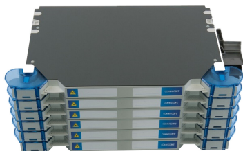
FACT® Fiber Optic Patch/Splice Chassis, gray, 6E high, 144-port, singlemode, loaded with LSH/APC adapters and B-grade pigtails, SMOUV splice tray type, left-hand patch