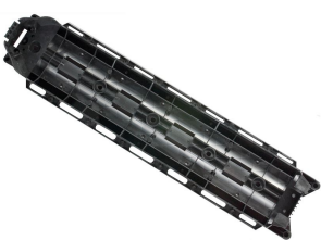
DLX® MST, Fiber Optic Universal Mounting Bracket, 12 port