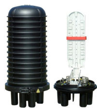
FOSC® 400 A4 Fiber Optic Splice Closure, Heat Shrink Cable sealing, one pre-installed 12-splice tray, with test valve