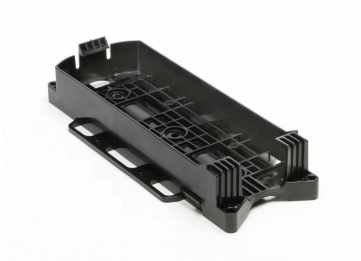
DLX® Mini-MST, Fiber Optic Universal Mounting Bracket