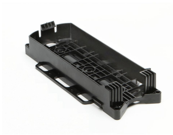
DLX® Mini-MST, Fiber Optic Universal Mounting Bracket