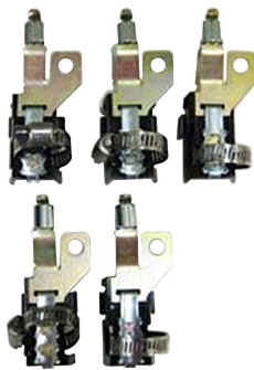
Mini-OTE 300-Series, Optical Terminal Pole Cable Retention Kit