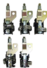
Mini-OTE 300-Series, Optical Terminal Pole Cable Retention Kit