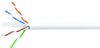
GigaSPEED XL® 1071E ETL Verified Category 6 U/UTP Cable, non-plenum, 4 pair count