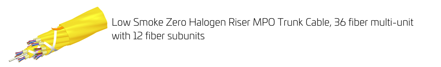
Low Smoke Zero Halogen Riser MPO Trunk Cable, 36 fiber multi-unit with 12 fiber subunits