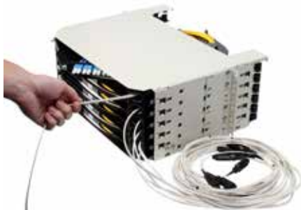
RapidReel Fiber Cable Spool accelerates fiber installation

Service providers now can reduce their cycle times dramatically. While they need as much as four to six weeks to deploy traditional solutions, they can deploy these new panels in a much shorter time frame—one day to two weeks. The Rapid fiber panel offers various sizes, cable types and standard cable lengths, giving service providers the flexibility they need to tailor