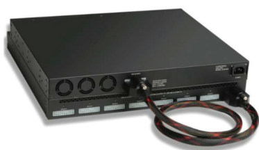
Figure 2. EPS4000 connected to ICX 7240-24P