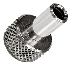
Visual Fault Identifier 2.5 mm Adapter