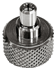
Visual Fault Identifier 1.25 mm Adapter