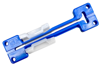
Fiber clamp, 2.0 mm