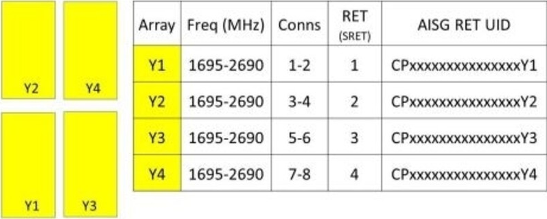
Bottom (Sizes of colored boxes are not true depictions of array sizes)