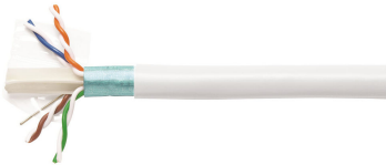
CS44R ETL Verified Category 6A F/UTP Cable, non-plenum, white jacket, 4 pair count, 3000 ft (914 m) length reel