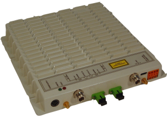
ION®-B Series Medium Power Remote Unit for GSM 1800 and UMTS