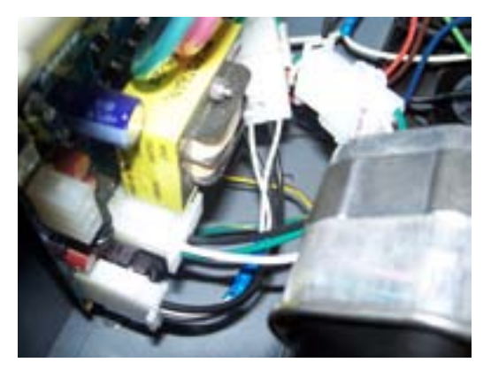
Figure 6 - Final Connection

6. Plug the other end of the 220/240 Vac jumper harness into the control board as shown in Figure 6. The connectors will only connect one way, so if they go together it is the correct connection.