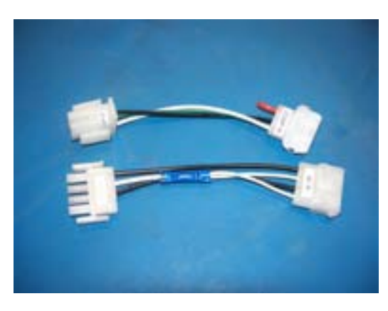
Figure 1 - Jumper Harness