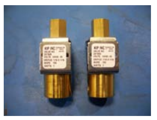
Figure 2 - Solenoid Valves; 220/240 Vac On Left, 120 Vac On Right

3. Remove the existing solenoid valve by removing the screws on the rear of the chassis. Install the 220/240 Vac solenoid in place of the existing solenoid valve. If the RC filter (blue rectangular piece in Figure 3) becomes damaged, insert the included RC filter jumper in between the existing wiring and the solenoid valve electrical (DIN) connector.