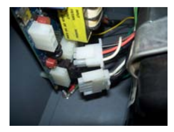
Figure 4 - Power Connectors

4. Unplug the two power connectors on the control board shown in Figure 4.