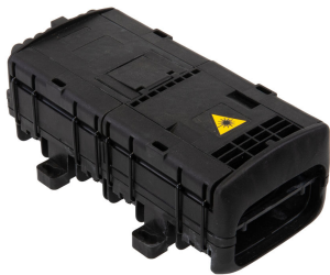
OFDC-A4 Fiber Optic Splice/Patch Closure, gel cable sealing, Top tray only, 24 splices,no adapters, no splitter