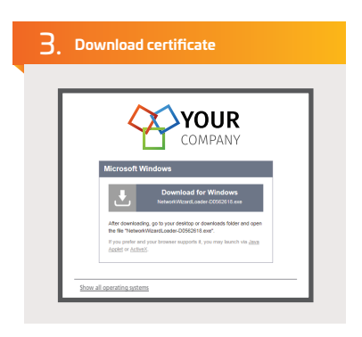
BYOD and guest users can easily onboard their devices for secure network access with intuitive self-service workflows—without IT intervention.

The Cloudpath service interoperates via its APIs with third-party products to further enhance security and improve user experience. It works flawlessly with any vendor's wired and wireless infrastructure. Unlike leading competitors, the Cloudpath service offers a unique combination of cloud-based or virtualized on-premises deployment, built-in multi-tenancy, cost-effective per-user licensing, and superior ease of use.