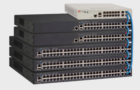
Figure 1. Stacking on standard Ethernet ports A stack of ICX 7150 showcasing the use of standard SFP+ 10Gbps dual-purpose ports and standard SFP+ short copper cables. The same ports can be used as 10GbE uplinks when not used for stacking.