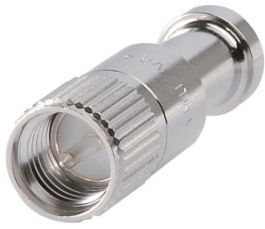
Mini UHF Male for 1/4 in FSJ1-50A cable