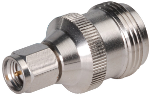
Type N Female to SMA Male Adapter