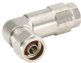
Type N Male Right Angle for 1/2 in FSJ4-50B cable