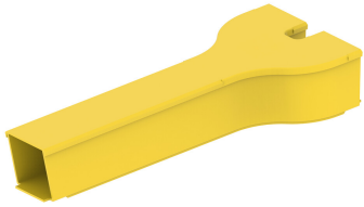
FiberGuide® Straight Reducer, 2x2 to Dual 2x2in, Yellow