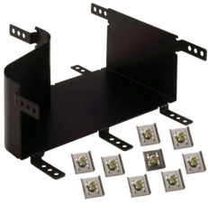
FiberGuide® Right Reducer, 4x12 to 4x6in, Black