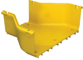
FiberGuide® Straight Reducer, 4x12 to 4x6in, Yellow